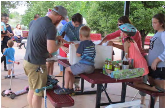
Exploring the Ice Cream Box