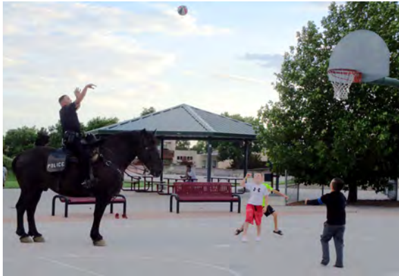
Another Assist by Stryker (the tall four-legged player)