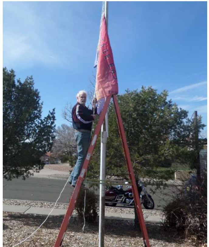
Board member Dave Allen at the inaugural hanging of our new neighborhood flag at Rotary Park.

of measures and 2/3 of the effected households will have to sign the petition to allow for any implementation of calming measures. Priorities and budgets also play a part in any actions. The NMTP manual can be found the City of Albuquerque Website - http://www.cabq.gov/neighborhood-traffic-management-program/documents/ntmp-policy-final-2015-lowres.pdf/view .